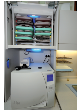
The A-dec Preference™ ICC includes provision for a W&H Lisa Class B sterilizer.

The majority of the installation of the new equipment and cabinetry was done after hours allowing the surgery to continue to operate without losing any patient days. The small plant room was also relocated and a new K300 Cattani compressor with Turbo Smart suction installed.