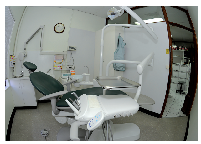
The three A-dec<sup>TM</sup> 300 chairs are a different shade of green to give each surgery its own unique identity.

optimum position. It has some nice features such as the overhead light which comes on automatically during recline which is quite nice."