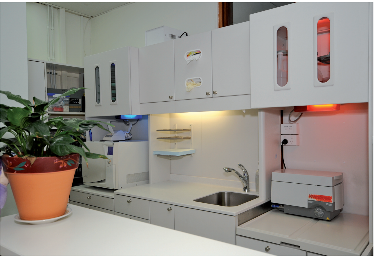
The A-dec Preference™ Infection Control Centre provides a comprehensive and efficient sterilization solution in a compact space.

tion Control Centre enabled instrument cleaning and sterilization procedures to be carried out in an orderly manner in a very compact space.